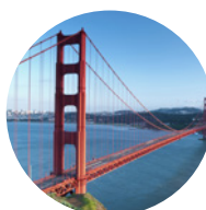
Silicon Valley & San Francisco